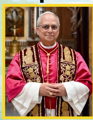
Pope Leo XIV